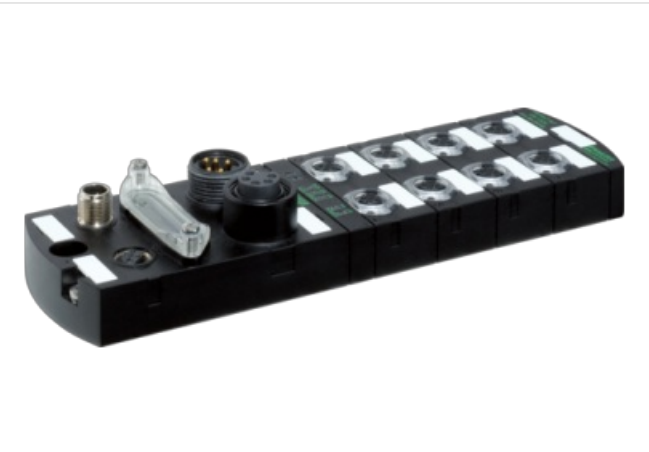
Product may differ from Image

Digital inputs/outputs DI8 DO8 - 2 A CAN 1 Mbit/s; M12, A-coded 7/8", 5-pole, 2× max. 9 A M12, 5-pole, A-coded Connection cables are in the online shop under "Connection Technology". Housing fully potted. mounting compatible with I/O modules of the MVK series