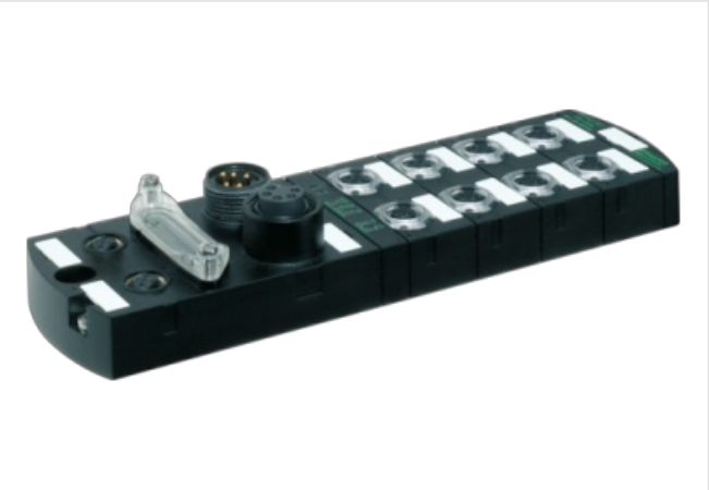
Product may differ from Image

Digital outputs DO8 - 2 A Ethernet 10/100 Mbit/s; M12, D-coded 7/8", 5-pole, 2× max. 9 A M12, 5-pole, A-coded Connection cables are in the online shop under "Connection Technology". Housing fully potted. mounting compatible with I/O modules of the MVK series