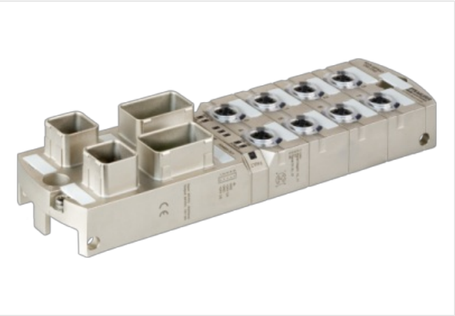
Product may differ from Image

Digital inputs/outputs DI8 DO8 (IRT) Ethernet 10/100 Mbit/s; 2× SCRJ45 POF Push Pull Push Pull Power connector, max. 12 A M12, 5-pole, A-coded Connection cables are in the online shop under "Connection Technology". Housing fully potted.