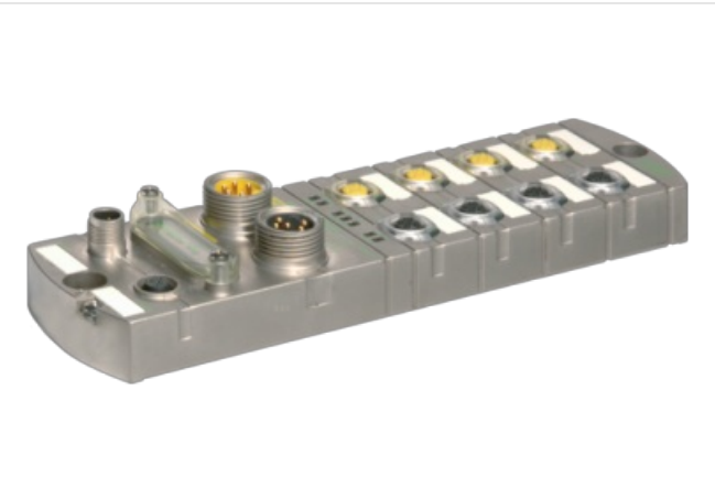
Product may differ from Image

Digital inputs/outputs DO4 DO4 DIO4 DIO4 (K3) PROFIBUS 12 Mbit/s; M12, B-coded 7/8", 5-pole, max. 9 A M12, 5-pole, A-coded Output groups up to PLd (EN ISO 13849-1) can be switched off via safety relays Connection cables are in the online shop under "Connection Technology". Housing fully potted.