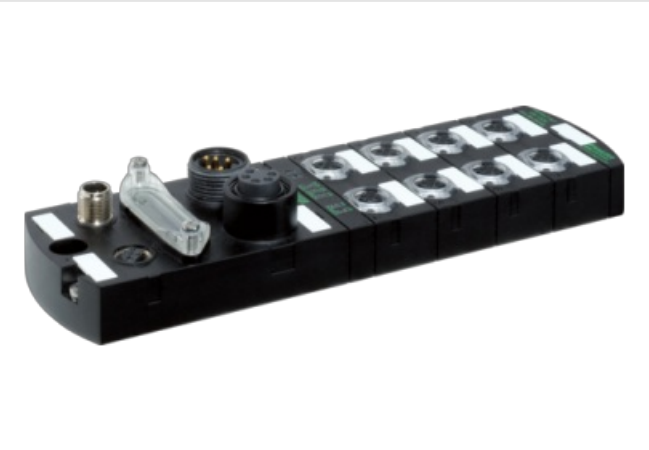
Product may differ from Image

Digital inputs/outputs DI8 DO8 - 2 A PROFIBUS 12 Mbit/s; M12, B-coded 7/8", 5-pole, 2× max. 9 A M12, 5-pole, A-coded Connection cables are in the online shop under "Connection Technology". Housing fully potted. mounting compatible with I/O modules of the MVK series