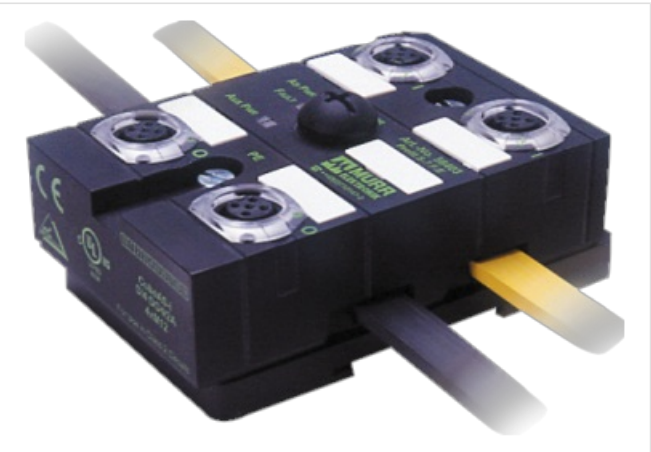
Product may differ from Image

MASI67 passive distribution box 2x profile cable to 4x M12 (female) Connection cables are in the online shop under "Connection Technology". Housing fully potted.