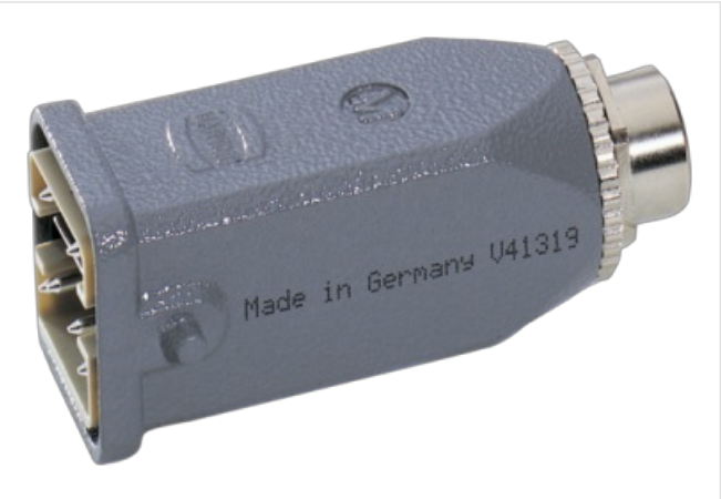
Product may differ from Image

M12 Male straight Internal system connection