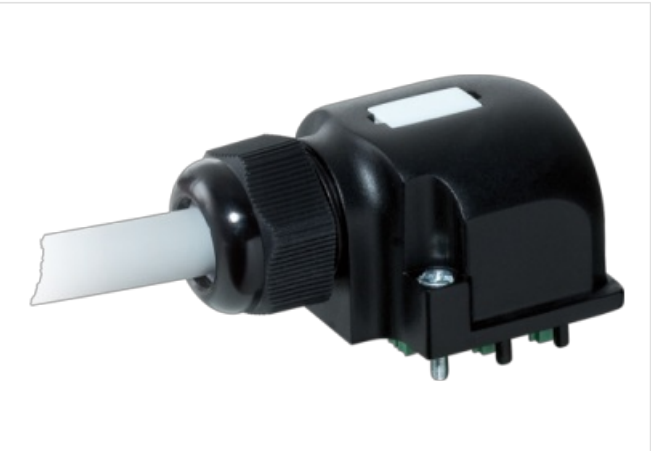
Product may differ from Image

Plastic housings with good resistance against chemicals and oils. The resistance to aggressive media should be individually tested for your application. Further details on request.