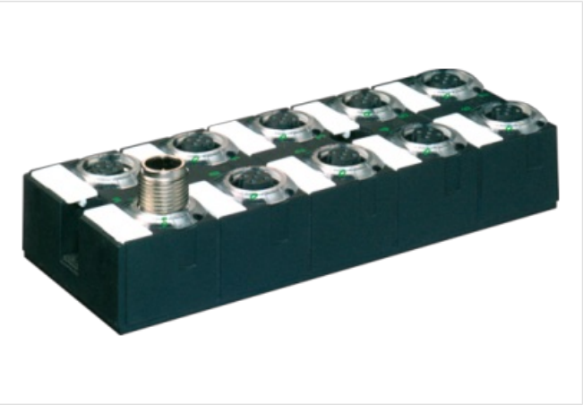
Product may differ from Image

Expansion module DIO16 - 0.5 A (E) - 8× M12 short-circuit and overload protected Digital inputs/outputs (multifunctional) Metal parts: Stainless steel Connection cables are in the online shop under "Connection Technology". Housing fully potted.