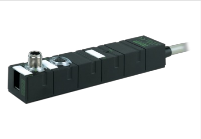
Product may differ from Image

Expansion module DO23 - Valve (E) 0.5 m Multipole plug (70 mA) SMC - Series SV Connection cables are in the online shop under "Connection Technology". Housing fully potted.