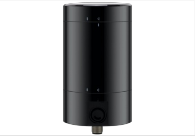
Product may differ from Image

Basic with M12 connection Outlet on the bottom IO-Link V1.1 Connection cables are in the online shop under "Connection Technology".