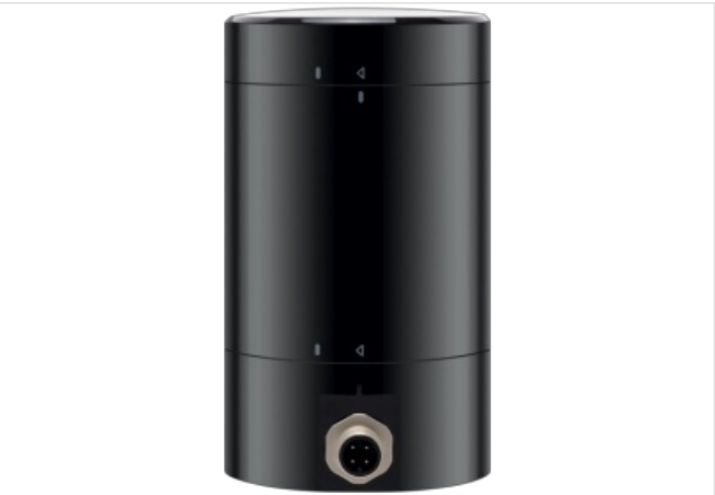
Product may differ from Image

Basic Outlet on the side with M12 connection IO-Link V1.1 Connection cables are in the online shop under "Connection Technology".