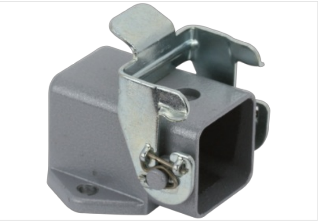
Product may differ from Image

A3 Bulkhead mounted housing Single locking lever IP65 Technical data will be only guaranteed with Murrelektronik components.