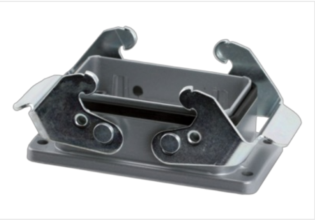
Product may differ from Image

B10 Bulkhead mounted housing Double locking lever IP67 Technical data will be only guaranteed with Murrelektronik components.